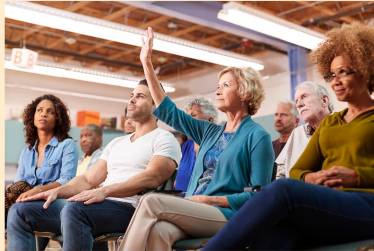
Launched Mayor's Drug Task Force