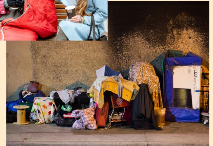
Mobile opioid treatment pilot program