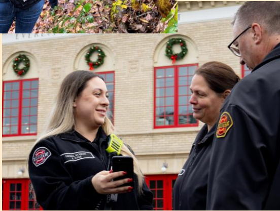
Expanding embedded social worker program